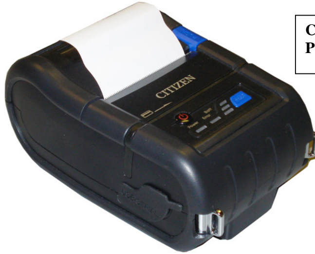
Citizen CMP-20 Portable Audit Printer

The Audit Printer can be used in any machine equipped with an EF Module or EF+ Module . This option allows the variety of Audits and in some machine models, can print the Event or Error logs. Review the machines owner manual for your changer to determine the audits and logs that are available for your specific machine model.